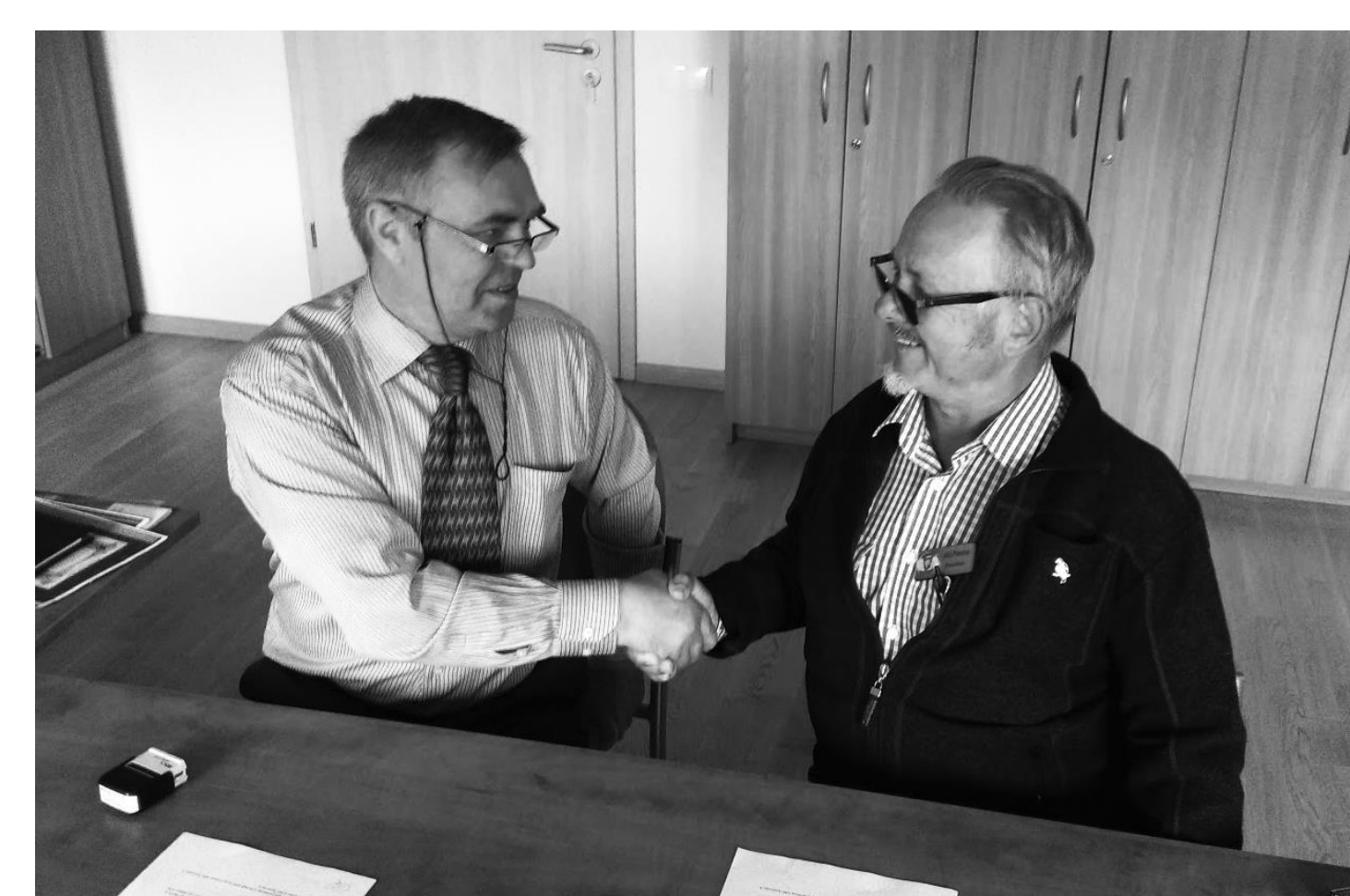
Tasmanian Arboretum (Australia) & Vilnius University Botanic Garden (Lithuania)