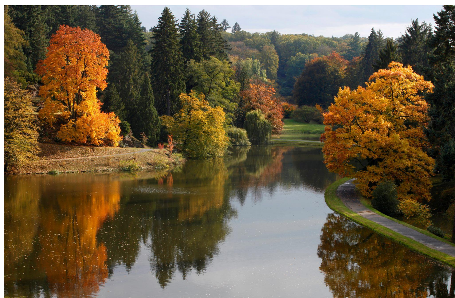
Průhonice Park (Czech Republic) Level III