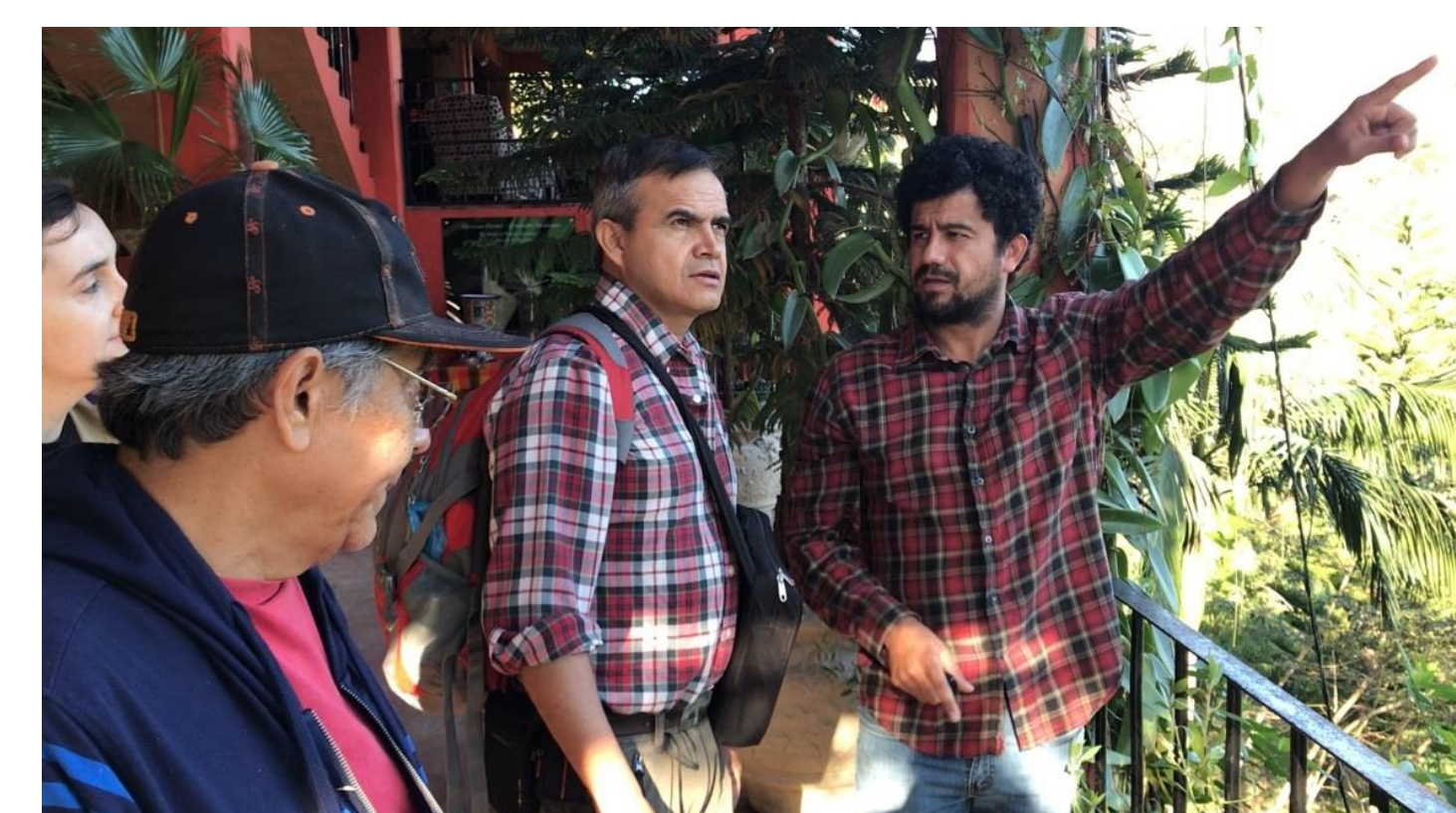
Vallarta Botanical Garden (Mexico) Level I