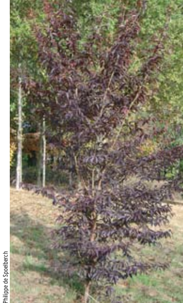
Philippe de Spoelberch

The autumn colour can be a pleasing rich scarlet. Trees reach up to 12m in the wild but the largest documented in cultivation (Seattle, Washington State) are between 7 and 7.6m (Jacobson 1996).