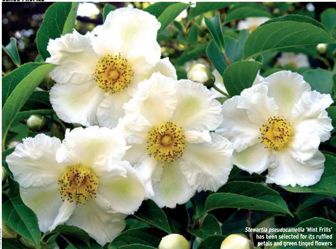
Stewartia pseudocamellia 'Mint Frills' has been selected for its ruffled petals and green tinged flowers