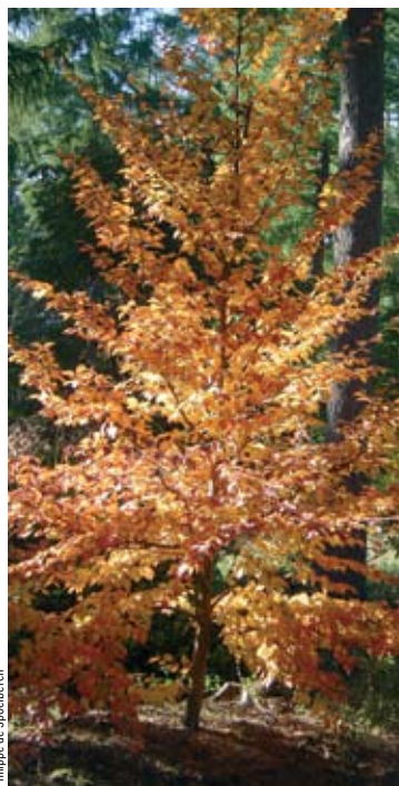
Stewartia pseudocamellia 'Harold Hiller' colours well in the autumn, even in relatively shady sites

Other institutions where Stewartia can be seen include the Morris Arboretum, Pennsylvania; the Scott Arboretum, Pennsylvania; the University of Washington Botanic Garden, Washington State; Quarryhill Botanical Garden, California; and the University of British Columbia Botanic Garden, Vancouver, Canada.